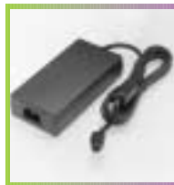
Power supply unit