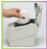
Drop-in paper load

In addition, the TM-T88III can print scannable horizontal or vertical barcodes, enabling customers to redeem money-off coupons or promotions quickly and efficiently in-store.