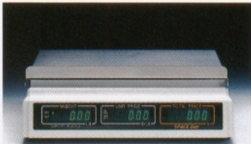
DISPLAY ON THE REAR SIDE