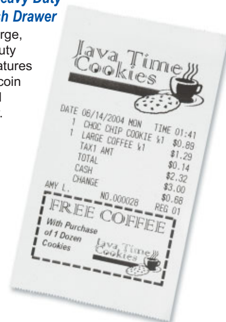
Receipt Shown 75% Actual Size